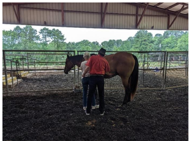
Caregivers and their person living with dementia participated in unmounted equine therapy at The Arc Caddo-Bossier's GREAT Program.