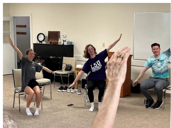
Volunteers from LSU Health Shreveport Medical School lead the caregivers and dementia individuals in exercise and movement to music.