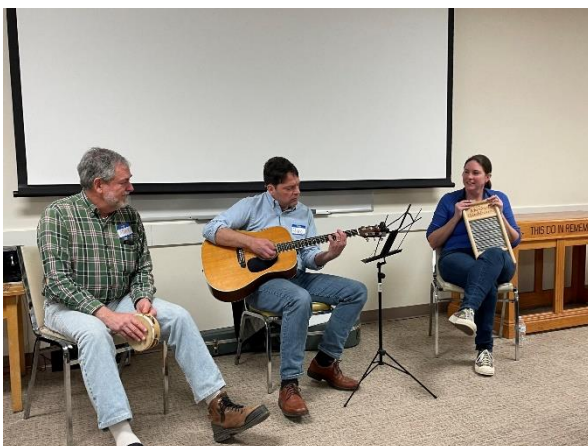
Pictured above: Volunteers lead the caregivers and dementia individuals in singing and using hand percussion instruments.

Second Saturday Workshops are activities held in-person on the second Saturday of each month at Broadmoor Presbyterian Church and is co-hosted with The Center for Brain Health at LSU Health Shreveport. This program came out of a need identified by the staff on hearing from caregivers that they needed activities for their person living with dementia, outside of their home and not necessarily a public place but rather a “safe place” for social stimulation. The caregiver can also use this time for respite. While staying on the church campus during the program, caregivers are welcome to read in the library or any other room for some quiet time and reflection. Most caregivers join in the activity because doing this together with their loved one can also bring joy. This is another program in which we pride ourselves in collaborating with community partners and other nonprofits.